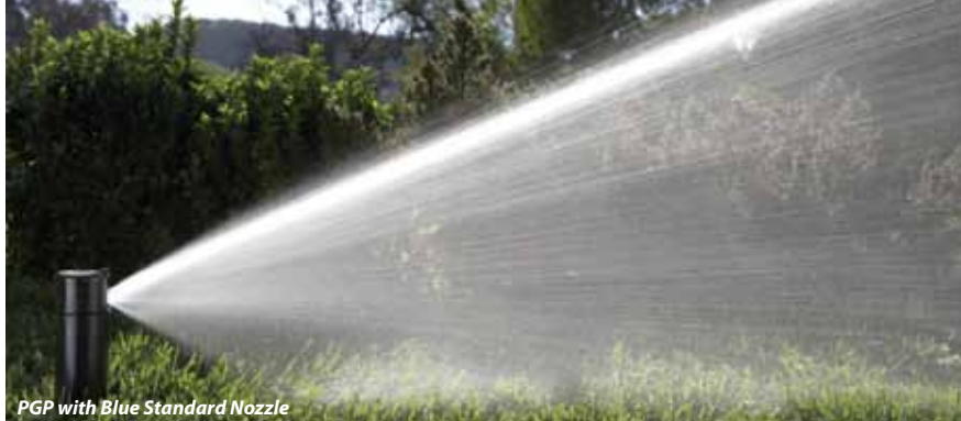
PGP with Blue Standard Nozzle

Only the PGP provides excellent coverage both close to the sprinkler as well as throughout its full distance of throw. The exceptional performance of PGP nozzles guarantees uniform results with no wet or dry spots in all head-to-head spacing installations from 20 to 45 feet. And because the nozzles are easily interchanged and adjusted, the installer can easily fine tune watering to meet field conditions.